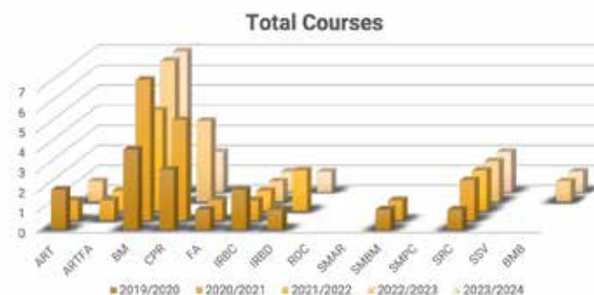
Table 4 Season 23/24 Statistics:

Below is a breakdown of total number of courses held over the course of each season.